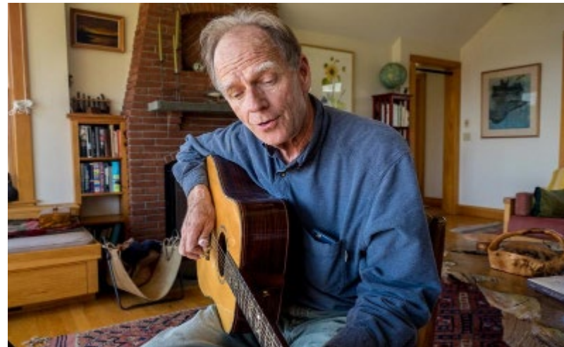
Strong Central Character